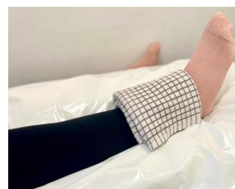
Ankle raised and wrapped in a cold pack to reduce pain and swelling