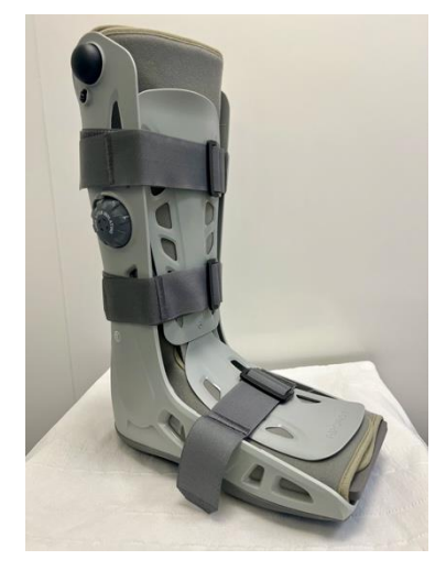
A boot protects your ankle and will make you feel more comfortable